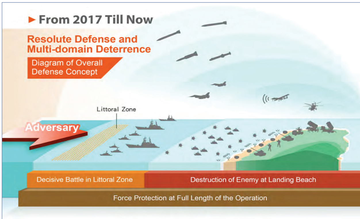
Figure. Diagram of the Overall Defense Contract