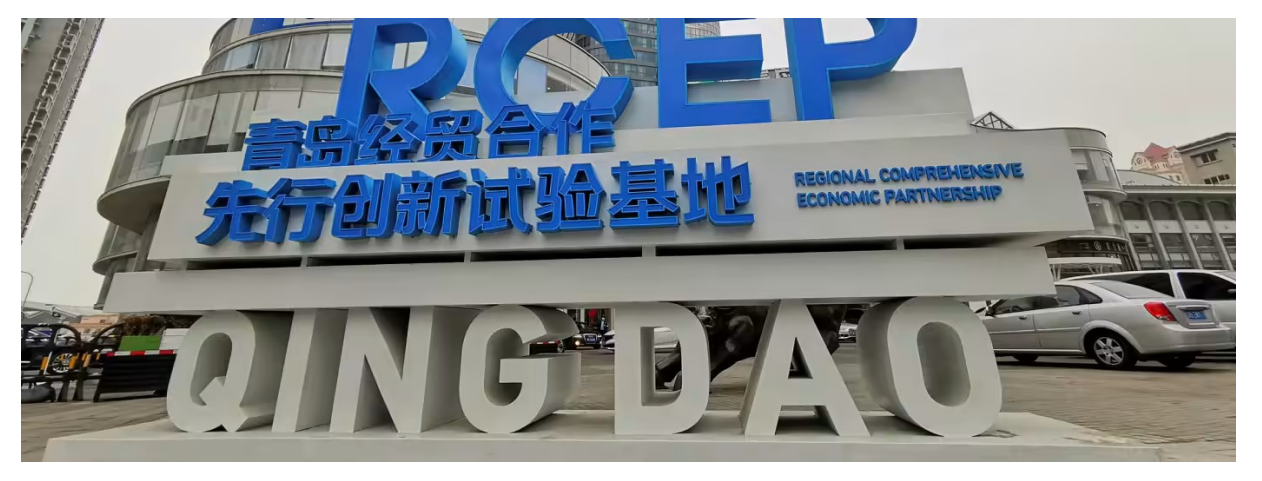
China in January signed a trade agreement — the Regional Comprehensive Economic Partnership — with the 10 members of the Association of Southeast Asian Nations along with Japan, South Korea, Australia and New Zealand