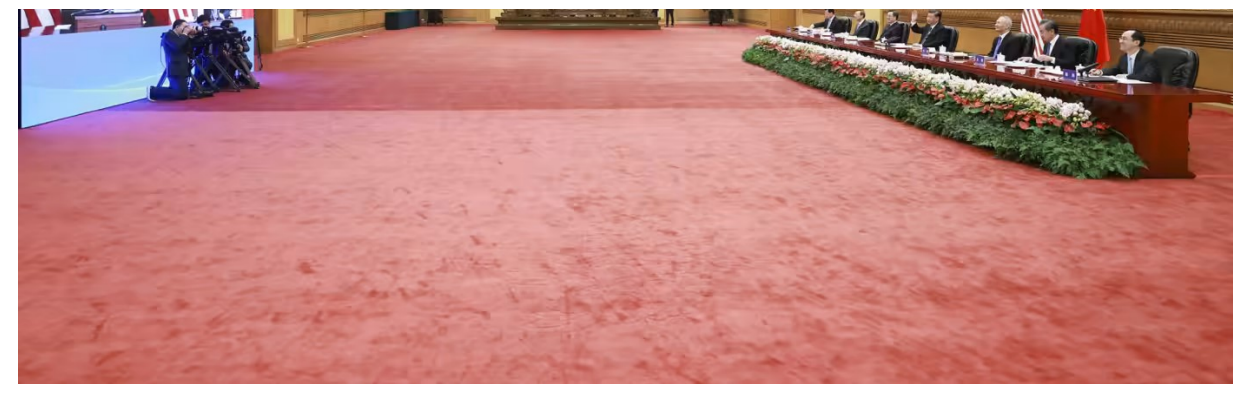
Xi Jinping meets with Joe Biden via video link in Beijing in November 2021. Relations between China and the US remain at their lowest level since they normalised diplomatic relations in 1979

One person familiar with the IPEF discussions says the US is focusing its negotiating efforts on eight countries: Japan, Australia, New Zealand, India, Singapore, Vietnam, Malaysia and Indonesia. Countries will be able to join some of the IPEF pillars without committing to all four. She stresses that the fact that there are eight countries engaging in serious discussions does not mean all of them will join the framework at the start.