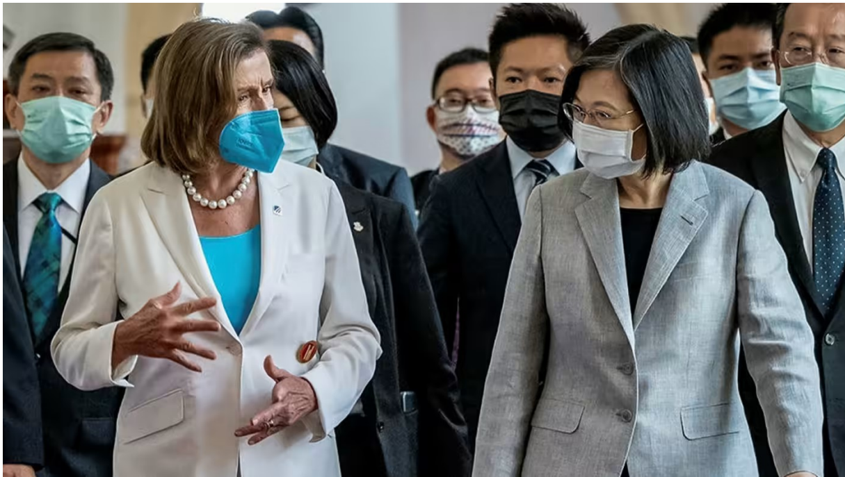
US House Speaker Nancy Pelosi, left, meets Taiwan's president Tsai Ing-wen in Taipei on Wednesday. Beijing has promised a military response to the trip