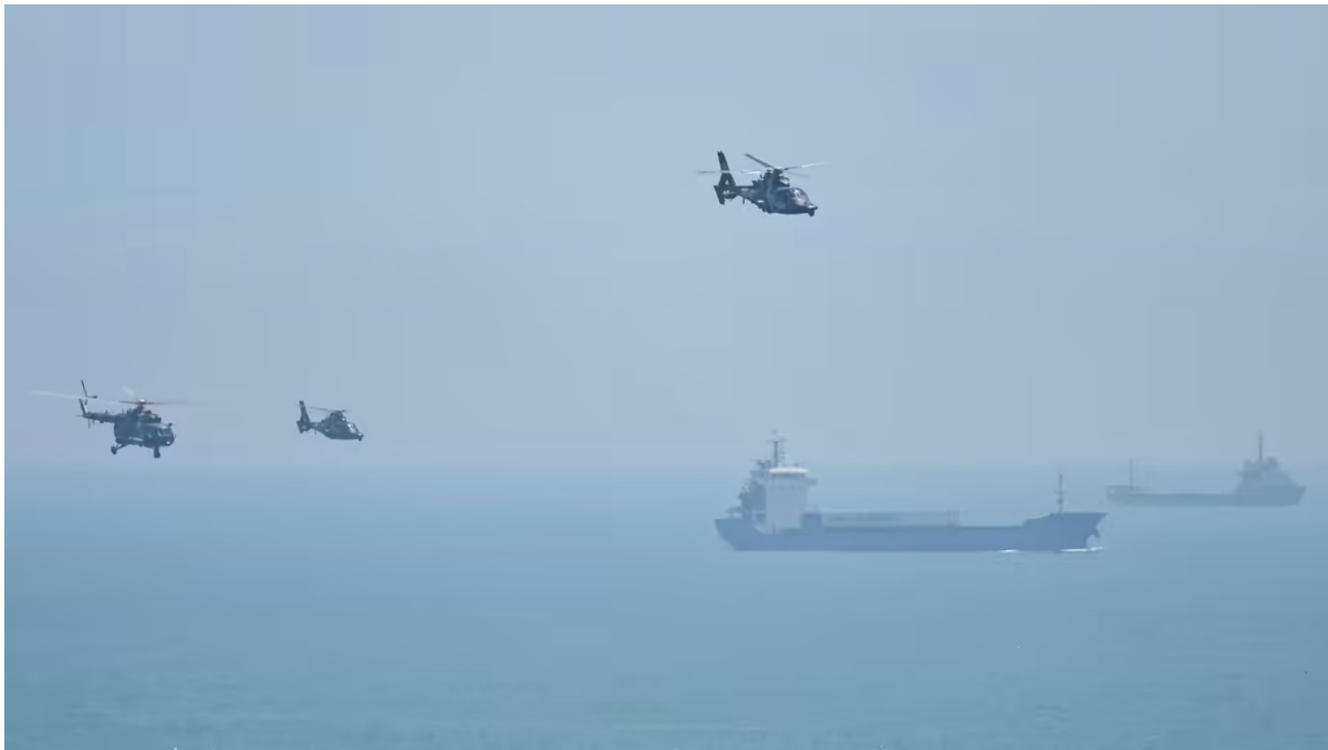
Chinese military helicopters fly past Pingtan Island, one of the nearest points on mainland China to Taiwan, before Beijing launched huge punitive military exercises on Thursday