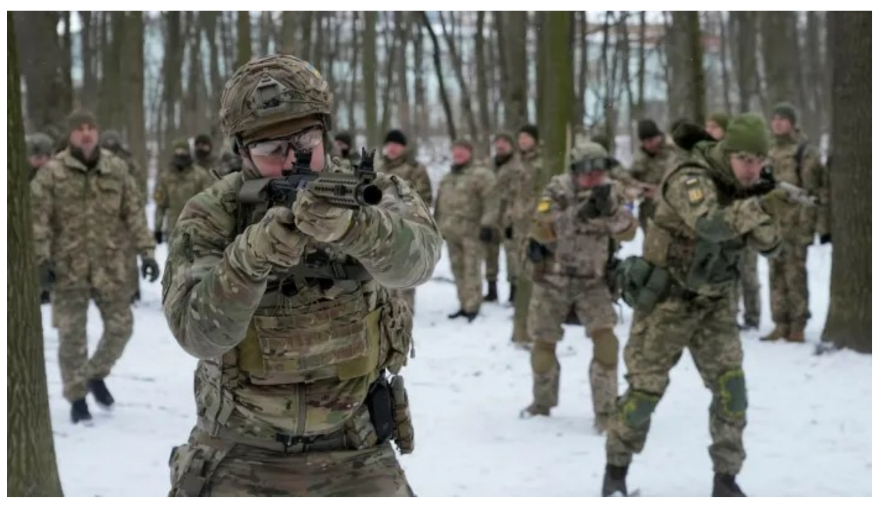
Ukraine's voluntary forces train in Kyiv as tension builds up between Russia and the west over a possible invasion