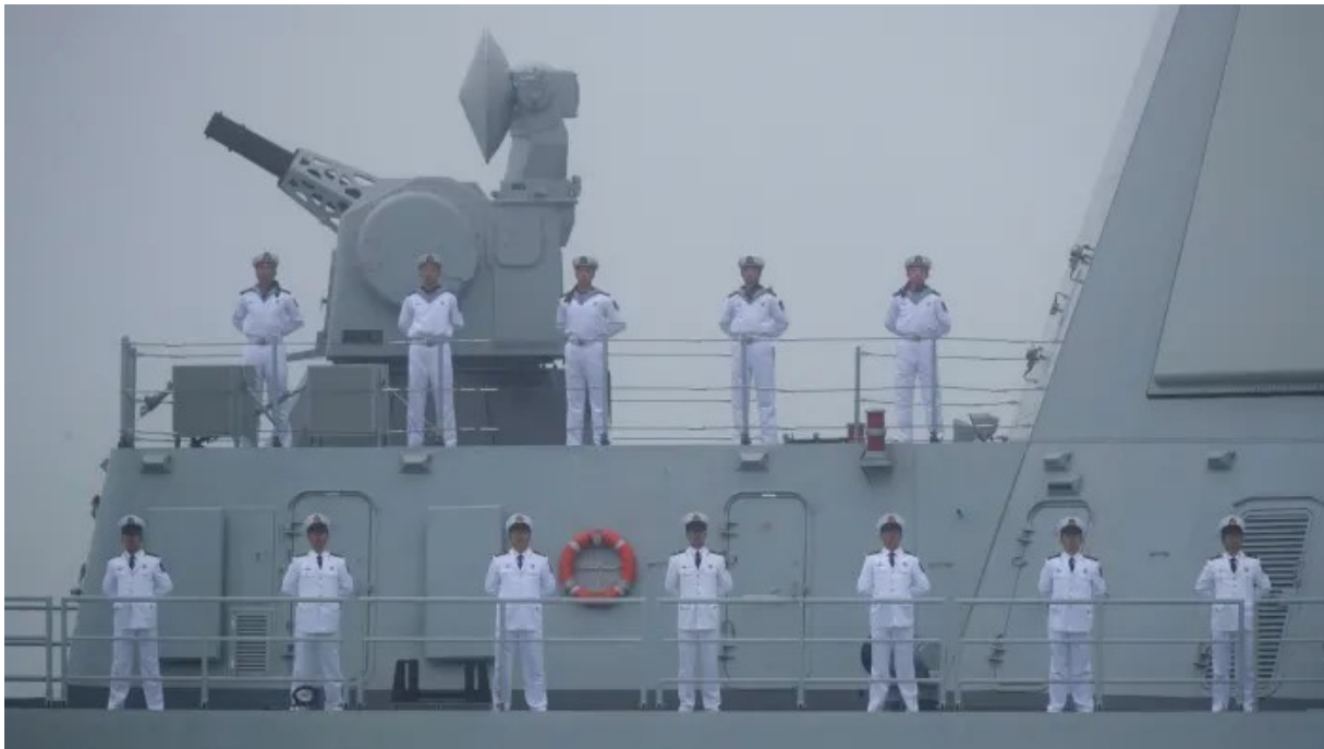
Sailors on parade aboard a Chinese People's Liberation Army Navy destroyer: analysts see the western Pacific as the main location for a potential clash between the US and China

Kathrin Hille in Taipei and Demetri Sevastopulo in Washington YESTERDAY