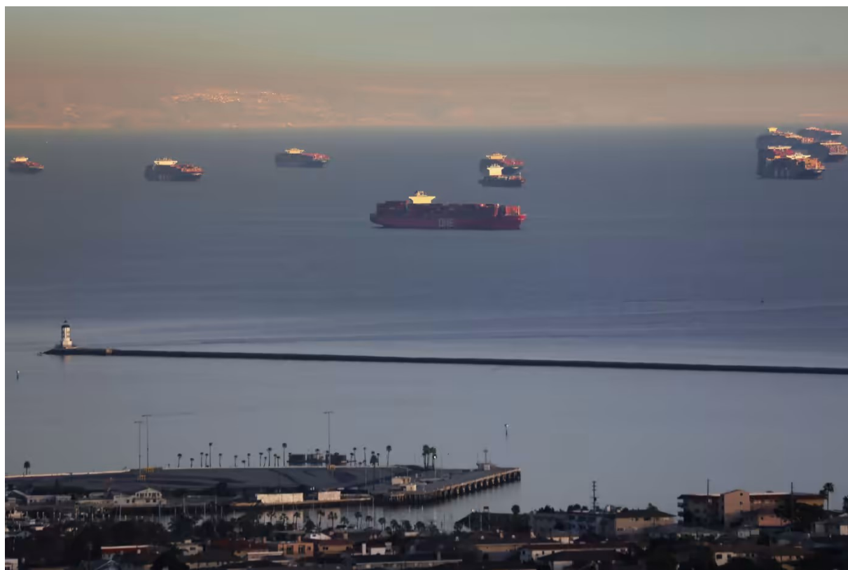
Container ships anchored off the port of Los Angeles. The US Democratic party says 'the global trading system has failed to keep its promises to American workers'