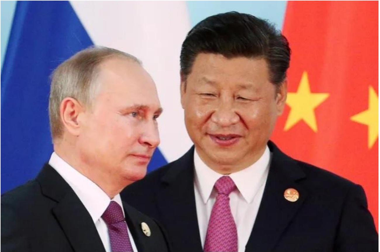
China is confronted with an unpleasant choice between the belligerent parties to the Ukraine crisis.

President Vladimir Putin's historic blunder in Ukraine has created a crisis in Europe that is costly for China but at the same time opens for it an opportunity for a new role in global politics. The costs are real and will continue to grow as long as the Russian invasion and occupation of Ukraine continues. China's tactical opportunity to contribute to mediation creates a strategic opportunity to move beyond the strategy of peaceful rise in a given international environment to one of providing key coordination in a post-hegemonic world.