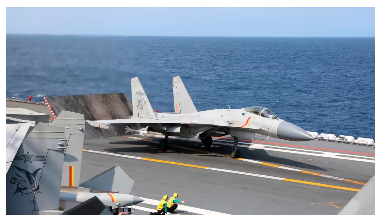
A J-15 Chinese fighter jet prepares to take off from the Shandong aircraft carrier during military exercises near Taiwan in April. The Shandong is one of two carriers the PLA Navy has in service