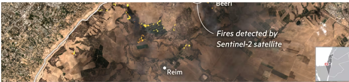
True colour satellite image composited with false colour image to highlight the fires