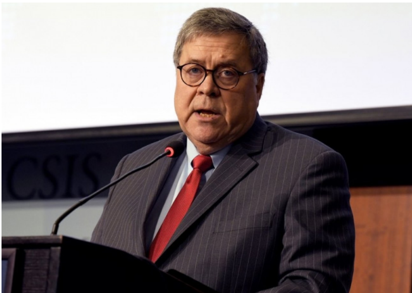
Attorney General Barr speaking at the Gerald Ford Presidential Museum in Grand Rapids, Michigan.

At the time it was unthinkable that China would emerge after the Cold War as a near-peer competitor of the United States. And even then, there were signs of China's immense latent power. In the joint report of their visit to China in 1972, House Majority Leader Hale Boggs and then minority leader Gerald Ford wrote: "If she manages to achieve as she aspires, China in the next half century can emerge as a self-sufficient power of a billion people... this last impression—of the reality of China's colossal potential—is perhaps the most vivid of our journey. As our small party traveled through that boundless land, this sense of a giant stirring, a dragon waking, gave us much to ponder." It is now nearly fifty years later and the pressing pondering as of these two congressmen have come to pass.