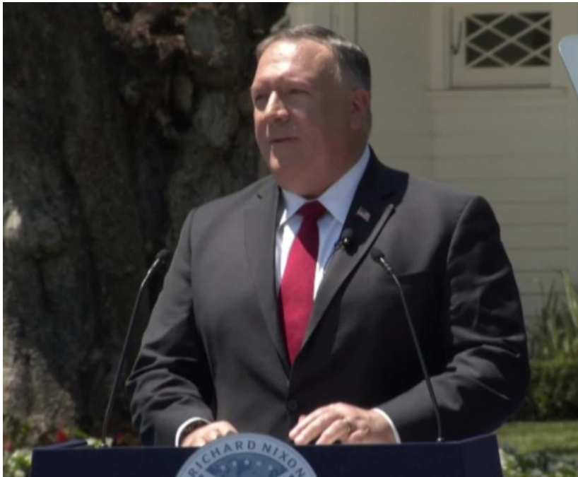
Secretary of State Pompeo gives remarks at the Richard Nixon Presidential Library and Museum in Yorba Linda, California.