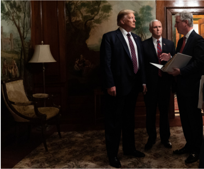
National Security Advisor O'Brien briefs the President and Vice President at Mar-a-Lago Resort in Palm Beach, Florida.

For decades, Donald J. Trump was one of the few prominent Americans to recognize the true nature of the Chinese Communist Party and its threat to America's economic and political way of life. Now, under President Trump's leadership, the United States is taking action to protect our nation and its partners from an increasingly assertive China. We are no longer turning a blind eye to the People's Republic of China's conduct nor are we hiding our criticism of its Communist Party behind closed doors.