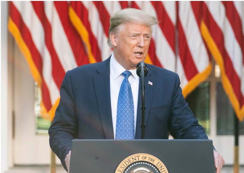
President Trump giving remarks in the White House Rose Garden.

Thank you very much. Good afternoon. Thank you. I'm here today to talk about our relationship with China and several new measures to protect American security and prosperity.