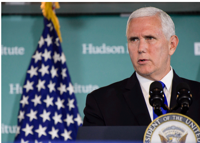
Vice President Pence giving remarks at the Hudson Institute.