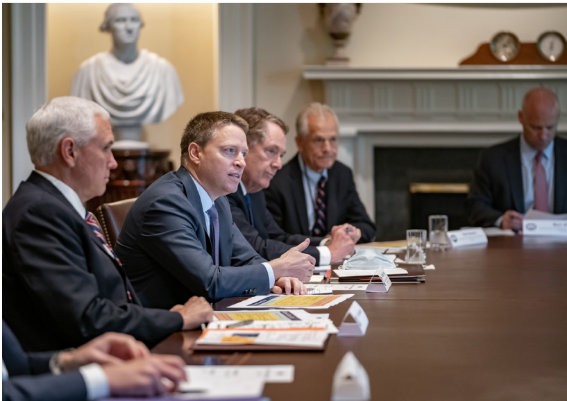
Deputy National Security Advisor Pottinger describes policy options to President Trump and Vice President Pence in a July 2020 cabinet meeting about China.

Good morning everyone. I'm Matt Pottinger, the Deputy National Security Advisor, speaking to you from the White House. I bring warm greetings from the 45th President of the United States, Donald J. Trump.