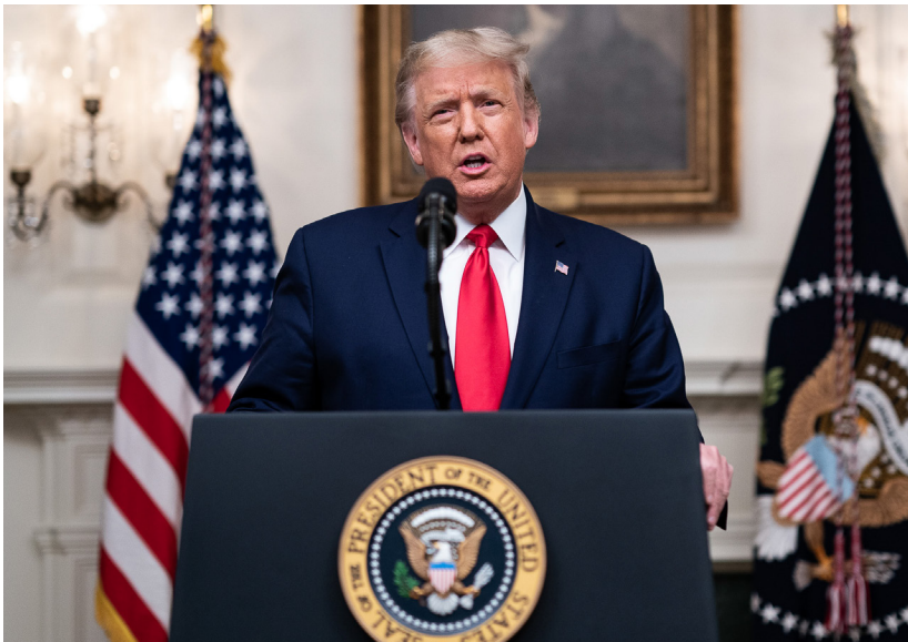
President Trump speaking virtually from the White House Diplomatic Reception Room to the 75th Session of the United Nations General Assembly.

It is my profound honor to address the United Nations General Assembly.