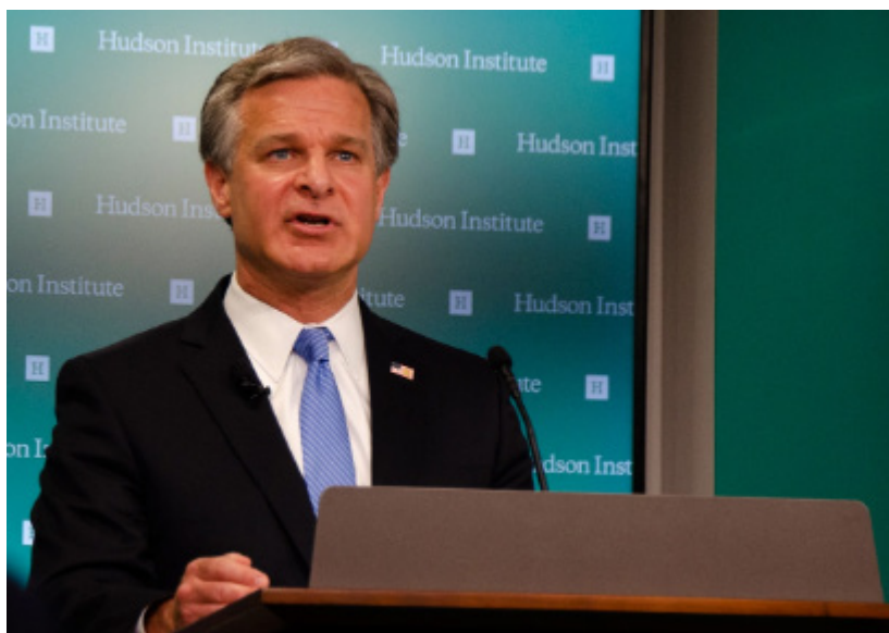
FBI Director Wray speaking at the Hudson Institute in Washington, D.C.

Good morning. I realize it's challenging, particularly under the current circumstances, to put on an event like this, so I'm grateful to the Hudson Institute for hosting us today.