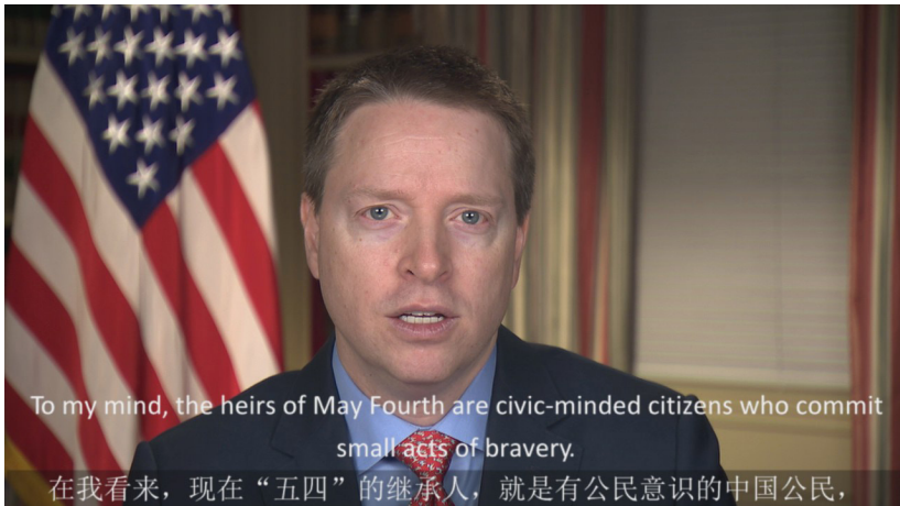
Deputy National Security Advisor Pottinger delivering remarks in Mandarin Chinese to the Miller Center at the University of Virginia.

Still, May Fourth leaders were constantly sapped of energy by accusations, sometimes leveled by government officials or their proxies among the literati, that the movement was slavishly pro-Western, insufficiently Chinese, or even unpatriotic.