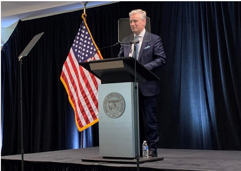
National Security Advisor O'Brien delivering remarks at the Arizona Commerce Authority in Phoenix, Arizona.