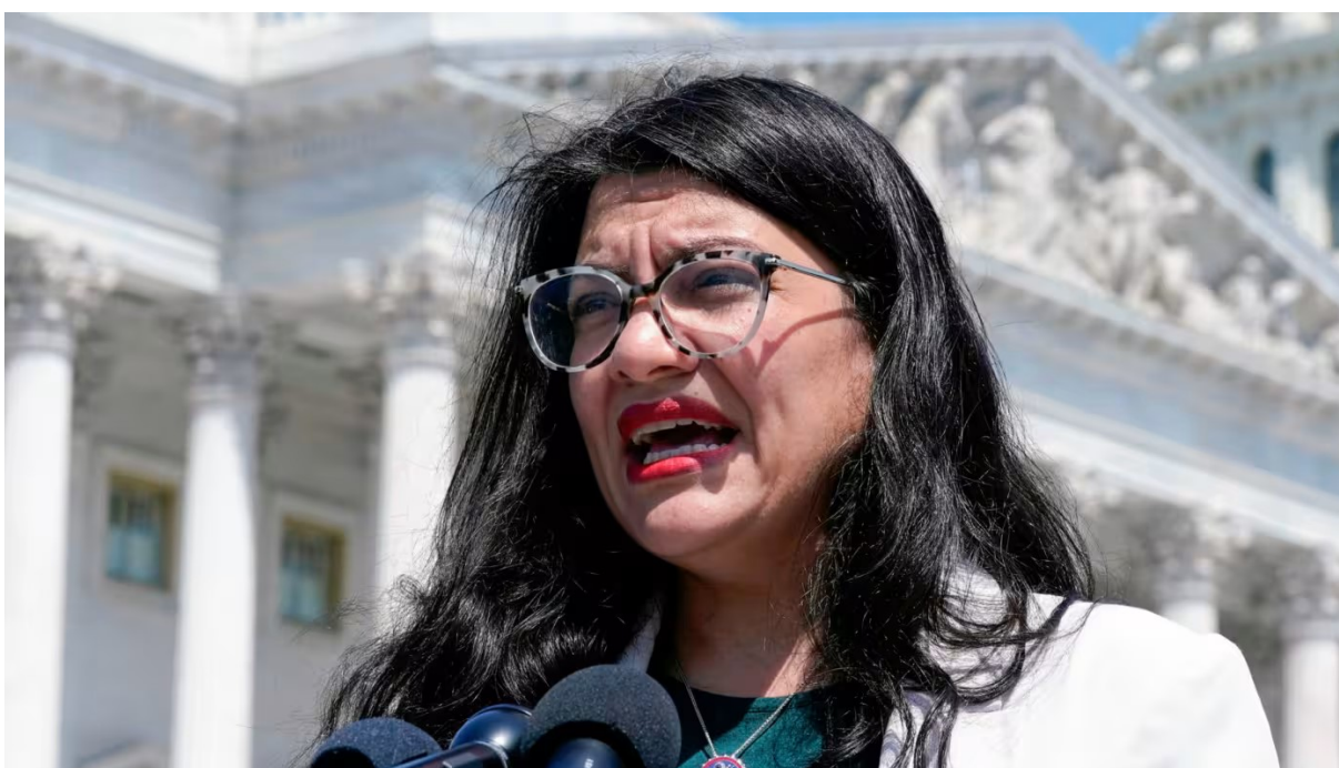
Rashida Tlaib of Michigan is the only Palestinian-American representative in Congress