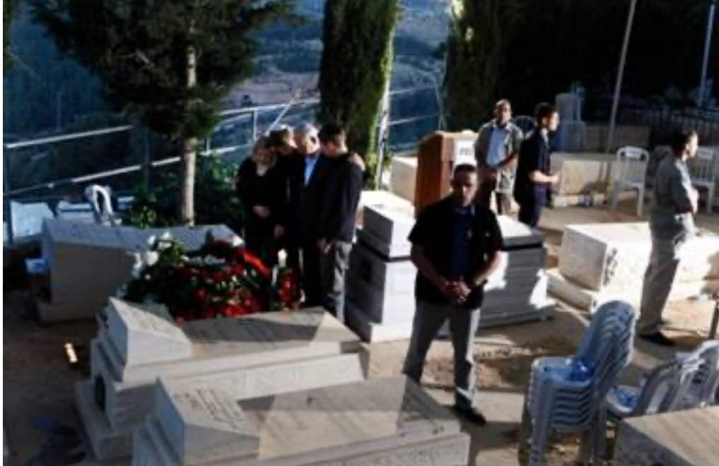
The Netanyahu Family at the Grave of Benzion Netanyahu

This forlorn outlook shaped Netanyahu's hard-right politics. As Reuven Rivlin, the speaker of the Israeli Knesset, put it today, "With Benzion there was no place for compromise, and for that reason he sometimes showed displeasure with needs that his son had as a politician, both in the United Nations and as a person who was elected to serve as the prime minister of Israel."