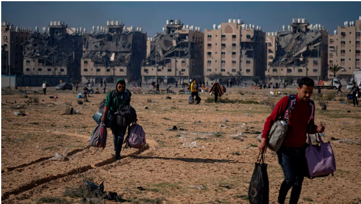
Palestinians flee from their neighbourhood in Khan Younis after Israel resumed its bombardment of the Gaza Strip

Felicia Schwartz in Simi Valley, California DECEMBER 2 2023