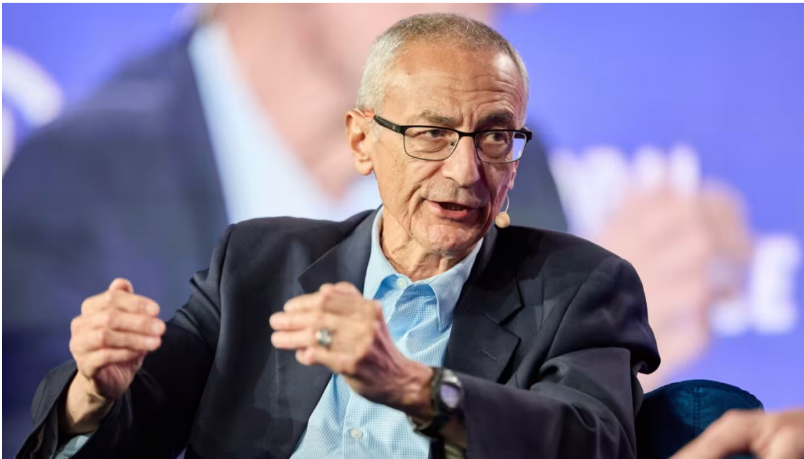
John Podesta, the US administration's top adviser on international climate policy, hosted his Chinese counterpart and staff for dinner at his home one evening