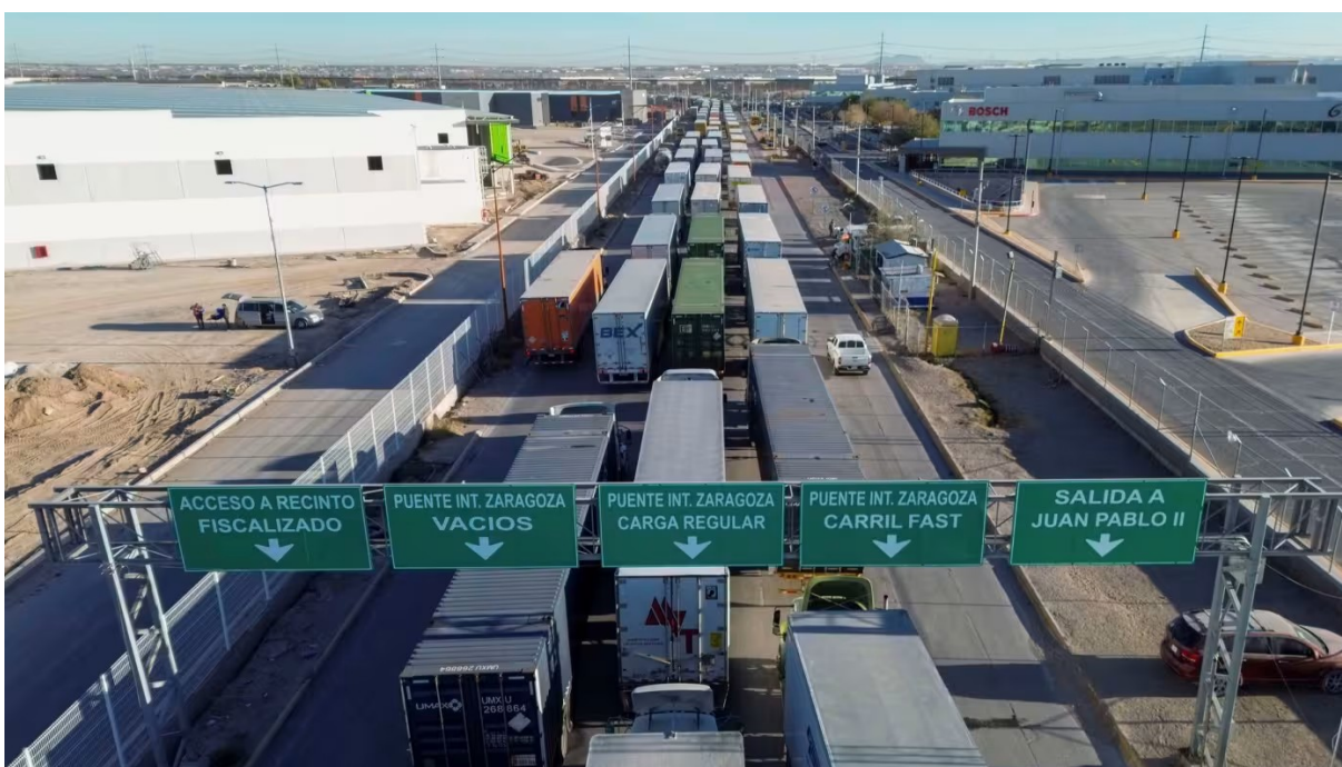
The Ysleta-Zaragoza bridge on the US-Mexico border. Mexico makes almost half of the car parts imported by the US