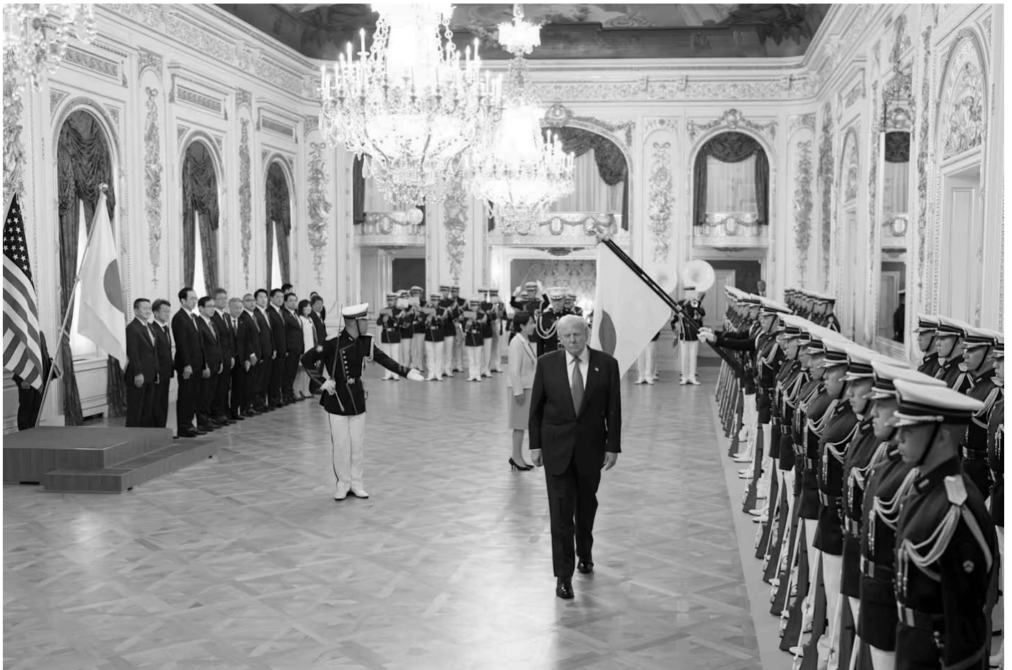
Trump on a visit to Japan in October 2025. Last year Tokyo agreed to invest $550bn in the US to prevent tariffs from climbing further

Trump had publicly accused Tokyo of a regulatory ruse in which balls were dropped from 20 feet in the air. The slightest dent, he said, could disqualify a US car from the Japanese market.