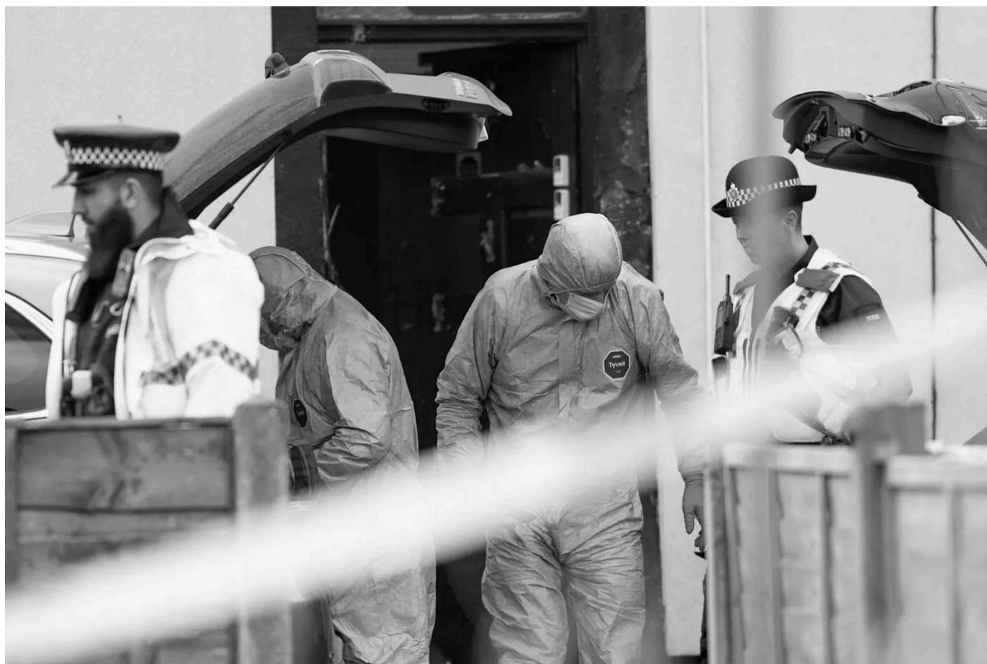
Last May, UK police arrested eight men, including seven Iranian nationals, in two investigations of alleged threats to national security

Last May, UK police arrested eight men, including seven Iranian nationals, in two investigations of alleged threats to national security. The cases are due for trial in October.