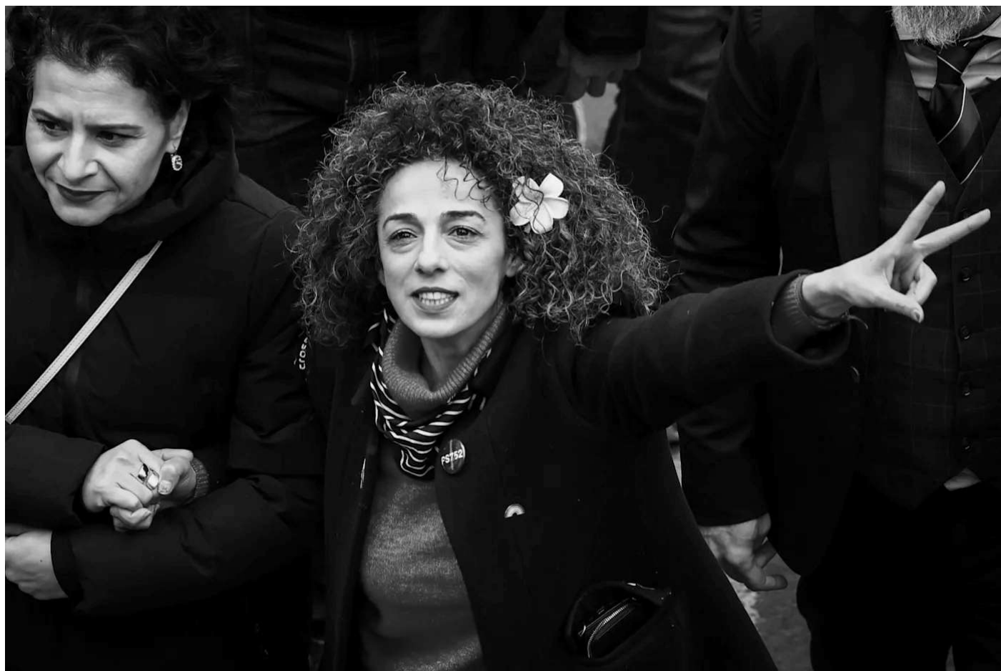
Iranian-American journalist and activist Masih Alinejad was the target of a Tehran-linked assassination plot